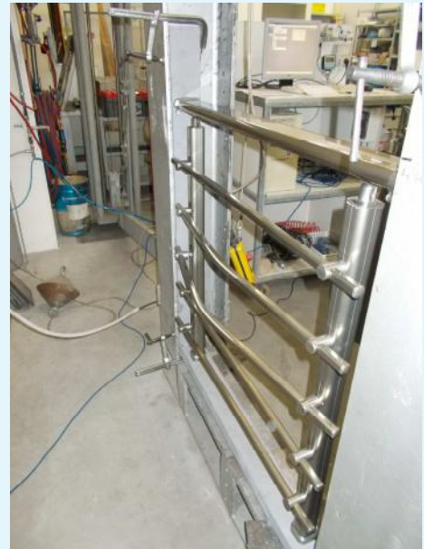
Photographs of the sample before and after impact