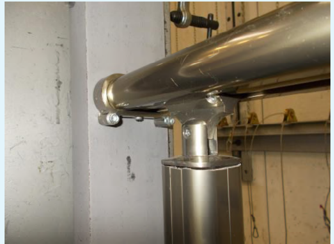
Photos of the sample