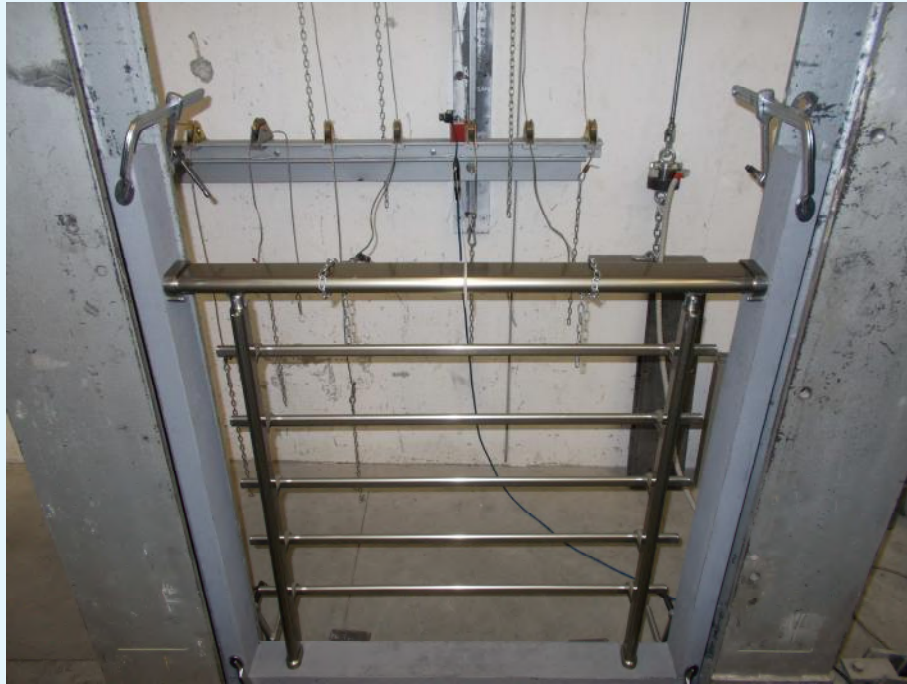
Photograph of the sample during resistance to horizontal static loading test